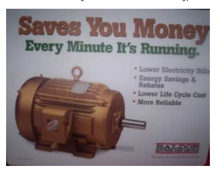
Baldors motors are located at <a href="http://www.baldor.com.au/">http://www.baldor.com.au/</a>

Baldors motors and drives Australia are the first in the world to launch such an environmental project and support such an incentive for greener electric motor technology.