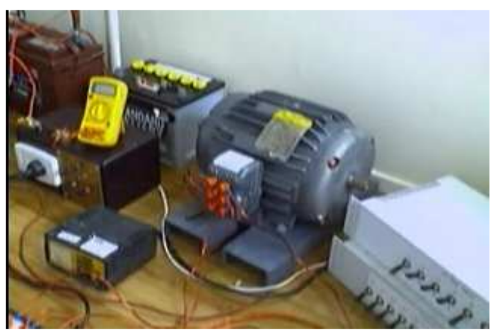
Panacea's replication showing a BALDORS RV motor modified for energy saving applications.

Below is Panacea's replication of .8-1.13 1 HP (horse power) RV modified motor, if used in an identical role the motor will draw only 160 Watts when idling! And when loaded at 1HP, is estimated to be about at a 94+% constant efficiency.