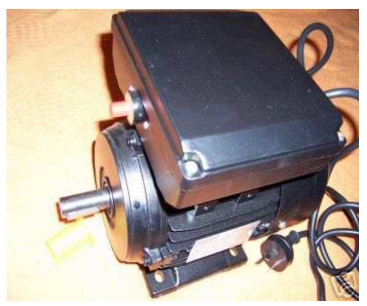
A normal one HP electric motor

Below is Panacea's replication of .8-1.13 1 HP (horse power) RV modified motor, if used in an identical role the motor will draw only 160 Watts when idling! And when loaded at 1HP, is estimated to be about at a 94+% constant efficiency.